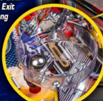
360° DEGREE BONUS BOWL