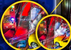
RAMPS UP RAMPS DOWN